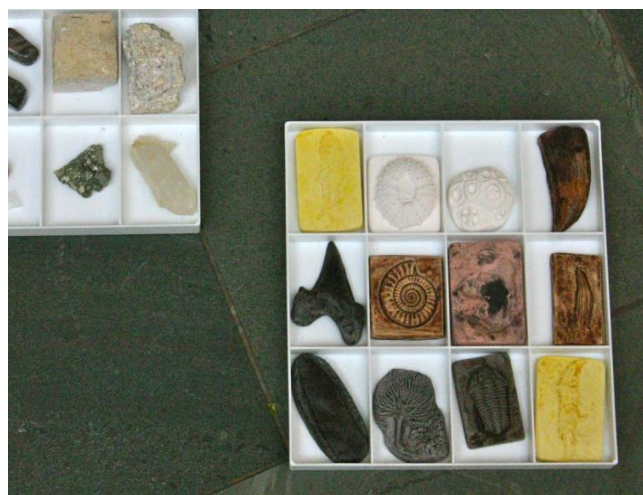
Figure 12: A box of fossil casts – part of the resource pack supplied to participants

Aspects of Earth Science are present in the current primary National Curriculum, and proposed changes to the curriculum include an increased content at key stage two. Primary age children often have a natural interest in, and enthusiasm for, volcanoes, dinosaurs and other geological phenomena that can be used to illustrate principles from other areas of science. However, when I read a Royal Society report on primary science and mathematics education (Royal Society, 2010), I was shocked to learn that only 3% of primary school teachers have a science background, and realised that the number with specialist knowledge in Earth Science must be even smaller. Anecdotally, many teachers are keen to teach Earth Science, but a lack of knowledge of basic principles and the absence of suitable resources and specimens make this task difficult. To address these issues I designed and delivered a short training session on Earth Science for key stage one and two teachers, held at the School of Earth and Environment (SEE), University of Leeds in 2012 and 2013. University of Leeds Access and Community Engagement funded this activity, so this continuing professional development (CPD) opportunity was offered to teachers free of charge. The funding represents the university's commitment to widening participation (WP). In that sense it is not designed to have a direct benefit for the university but is more altruistic.