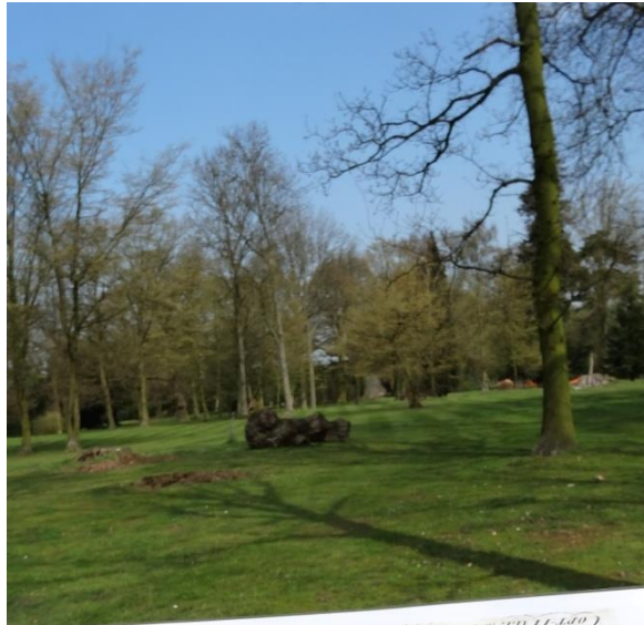
Figure 9: Geology students' work is centred on finding out about the site of the (buried) former gardens at Copped Hall. They apply geophysical imaging with the help of a drawing of the original gardens, which is shown in the photo.

Public engagement is often understood as a form of outreach activity led by academics. However, university students can also play a central role in these activities and can enhance their own learning at the same time. This case study outlines how Geology undergraduates on a geophysics field course at Birkbeck, University of London, have been engaging with the Copped Hall Trust Archaeology Project as part of their problem-based learning (PBL). Copped Hall is located in Epping Forest on the north-eastern outskirts of London and is the site of a 16th to 17th-century mansion and formal gardens (Figure 9).