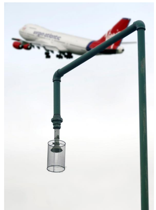
Figure 10: Aircraft noise may be measured in decibels, but disturbance is a matter of perception and dependent upon non-acoustic factors such as lifestyle, affluence or fear of air accidents.

complex and difficult for the general public to understand, and this thereby generates a climate of misunderstanding, misinterpretation and mistrust