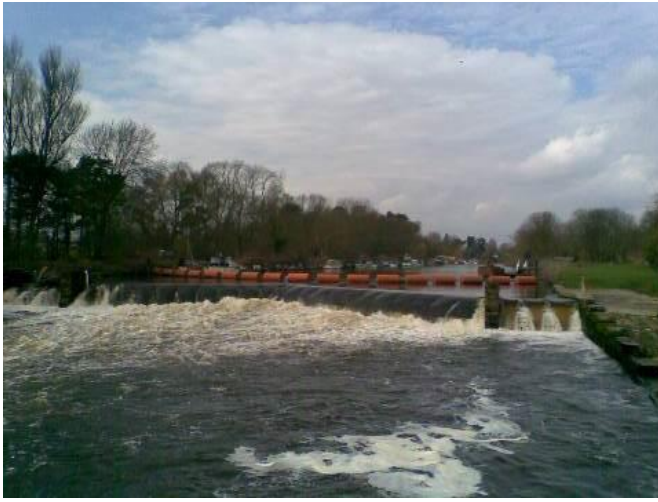
Figure 13: A typical investigation site – weirs on a river in the north-east of England

The potential for undertaking this work was revealed following a chance approach during a public inquiry, when I was acting as an expert witness for a local authority presenting hydrological evidence for a planning appeal. An off-duty detective sought me out during a recess to ask if I had ever looked at human bodies floating down rivers. Having previously taught groups of students about flow patterns in the meandering River Severn by floating small groups of them short distances downstream in wetsuits, I offered to see whether I could assist his enquiry. As a result, I was subsequently included on the expert witness database used by other forces, and a series of other commissions followed.