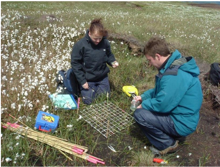
Figure 15: Early experimental trials by undergraduate and MSc students, adding Sphagnum beads