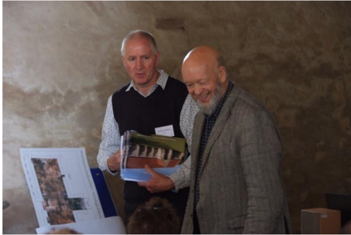
Figure 6: Top left – Bristol students working at Winterbourne Medieval Barn; top right – gloves awaiting volunteers; bottom left – Michael Eavis CBE (founder of the Glastonbury Festival) recounts his own experiences of regenerating the medieval barn at Pilton.