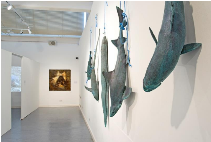
Figure 5: Part of the Red List exhibition