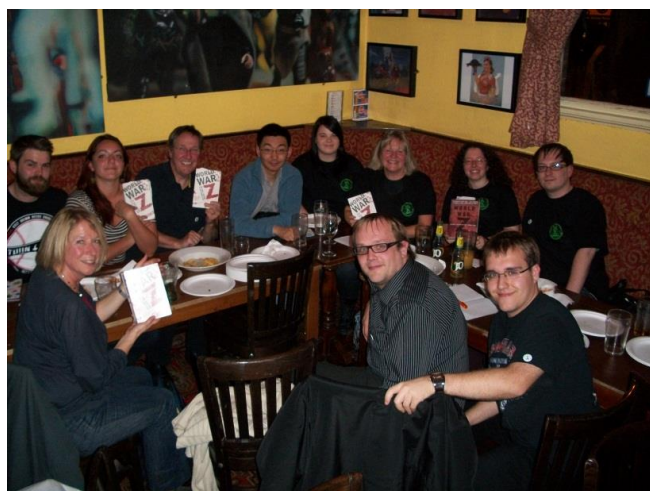
Figure 1: Members of the public and microbiologists in discussion during a Bad Bugs Book Club gathering