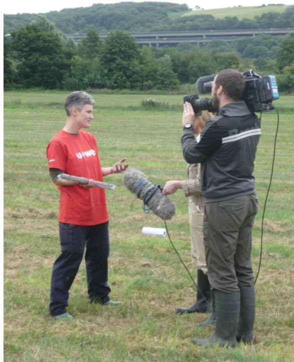
Figure 4: A UWE geography academic being interviewed by the BBC, explaining how the sediment core was collected and what it reveals about climate change

The sediment core exhibit helped visitors to understand how a record of climate and environmental change is recorded in fossil sediments spanning 15,000 years of Earth's history. It consisted of a 1:1 scale sediment core (displayed vertically to emphasise the length of the archive beneath our feet), supported by an interactive film explaining how the core was collected and the evidence it contains for climate and environmental change.