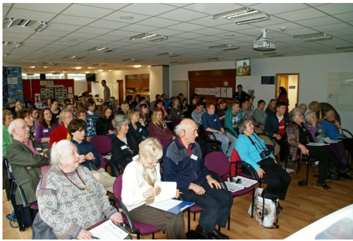
Figure 7: Conference participants (left)

Rather than simply suggesting to students that they attend the conference because it was 'good for them', learning activities within the module were modified so that they became more aligned with the conference experience. Within the module, students were required to produce a poster for the conference on a development theme of their choice, but with the caveat that they at least attempt to highlight the synergies between their development topic and the conference theme. Prior to the conference, posters were presented during a class 'gallery' session for peer review and discussion. The best six were subsequently enlarged for display at the conference itself, where all participants voted for a winner and runner up who each received a small prize. Although the poster