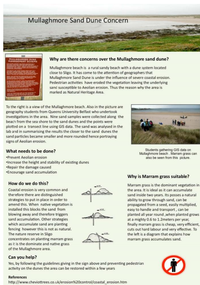
Figure 14: One of the student posters generated from field and laboratory work and prepared for public display

In the GEES disciplines, we often ask students to undertake quite complicated analyses and investigations, in the laboratory, the field, or frequently, a combination of both. Ideally, such investigations should be realistic and problem-based so that field or laboratory research can help to answer questions posed by a contractor, for example, rather than being merely an academic