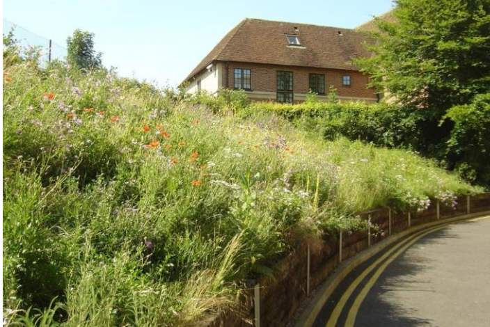
Figure 3: Part of the ‘green link’ to the wider campus-based Bioversity initiative