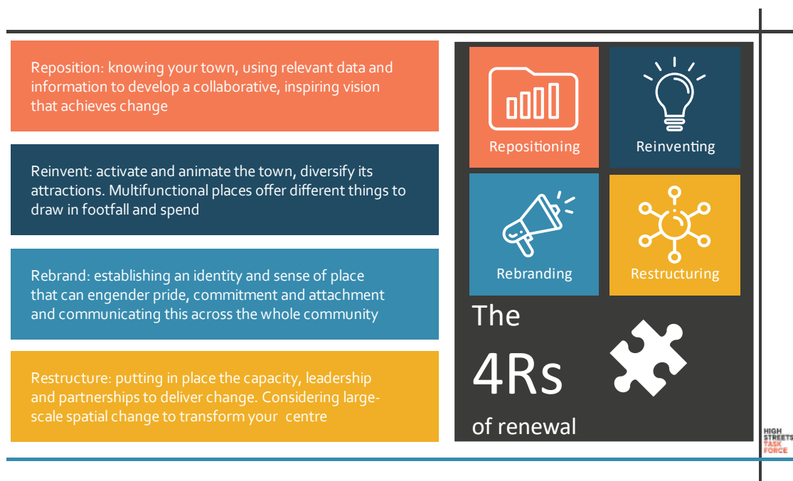
Fig 1: 4 Rs Framework Outline Summary

The Unlocking Your Place Potential Report (UYPP) written by Taskforce experts, draws on the IPM's 4 Rs Framework and indicates which of the Four Rs is the correct renewal strategy for the town: