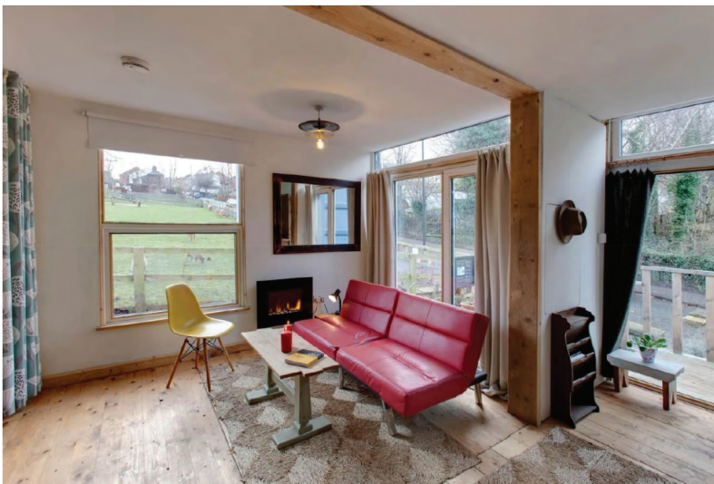
Figure 2. An interior view of the REACH prototype at heeley city farm, the exposed wood column and beam were acquired from a church. (REACH homes, 2016).

"[the roof is] just Kingspan glued to the outside with render over the top ... it came from the roof of the mosque, while they were replacing it, the panelling in the shower room was the front of the counter at the Indian restaurant opposite the mosque, which they were chucking out. Cymbal's up there [acting as a light fitting], bedhead's an old piano, every bit of wood here's reclaimed." Interview with a director speaking about the prototype, see Figure 2. 17/08/18.