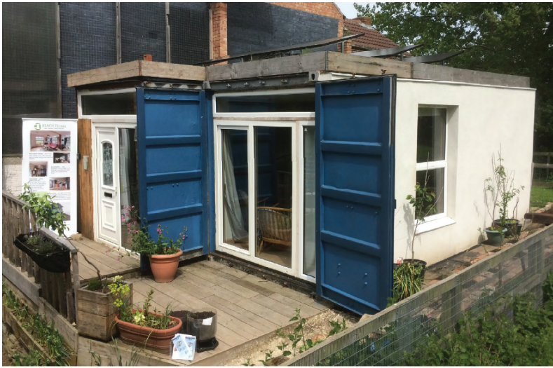
Figure 1. REACH's prototype, a proof-of-concept house and base of operations that served as the home for the founder. REACH homes, 2016.

is a previously unrecognised transaction named here as direct equivalence. Direct equivalence is a non-equivalent exchange of commodities between two agents. Direct equivalence took many forms with REACH and the following three examples provide the breadth of this: