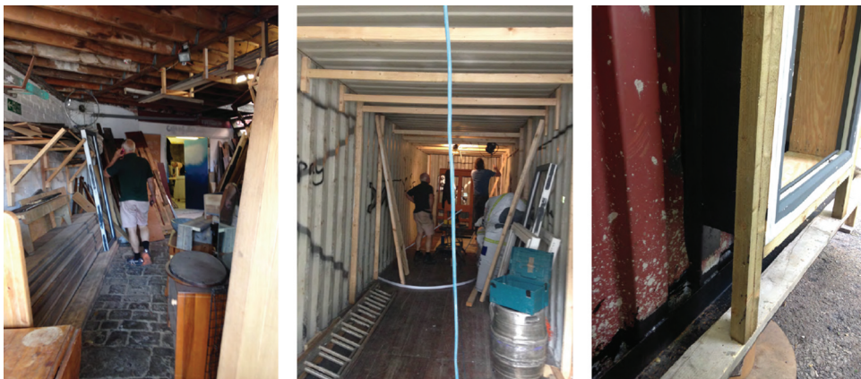
Figure 3. An interior view of strip the Willow and the use of Strip's wood in the construction process (Author's own, 2019).

In comparison to the acquisition of waste materials REACH failed to acquire new materials from manufacturers, companies who produce and commercially sell